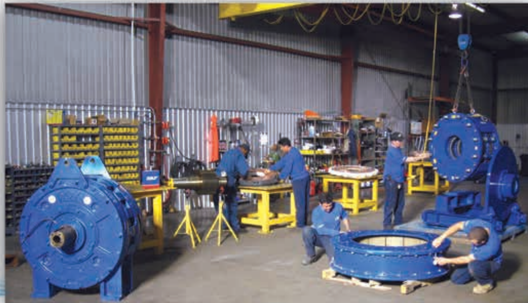
Our service team is available 24-hours per day, 7 days per week, and is ready to provide your field service or shop repair needs.